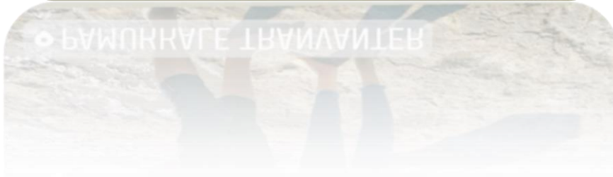
◉ ПАМУККАЛЕ ТРАВАНТЕР