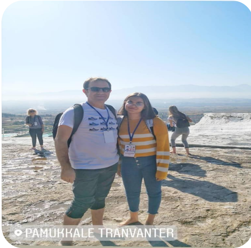
◉ ПАМУККАЛЕ ТРАВАНТЕР

We went to Pamukkale . we ate something and then we explored the city . We went to Hierapolis and Pamukkale Travertine . We took a lot of photos .